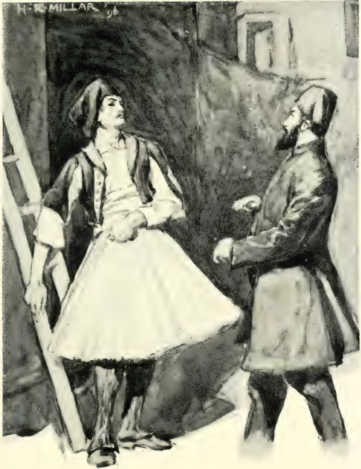
"A THOUSAND PARDONS, MY LORD!"